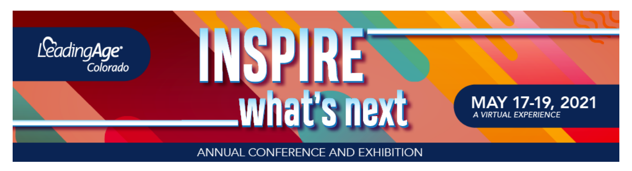
Exhibit and Sponsor Opportunities

We have created a virtual event to help your company connect with providers during a time when gathering in person is not possible. Each day includes cutting edge educational programming, engaging conversation, social time and more. A dedicated EXPO of non-competing time is scheduled each day. Your company's virtual booth will be viewable for 3 months on demand long after the conference is over.